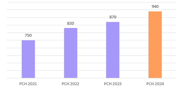
People involved with PonyCon Holland 2024